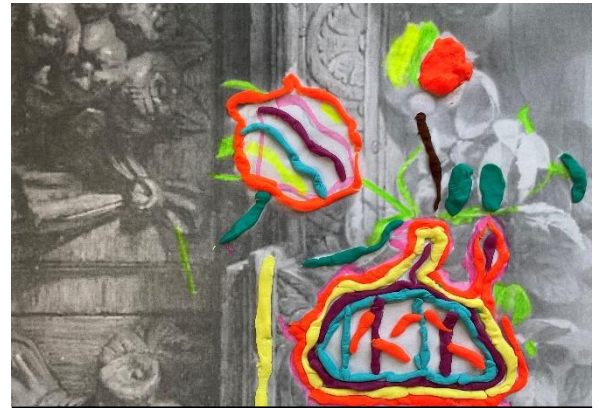
Collage from In the Joy Fantastic workshop

It's June, the weather is warmer and we are excited to be celebrating together with 'In the Joy Fantastic', a day of celebration at the Wallace Collection on June 5 th . Join us for a bit of a party, live music and art workshops, as well as a chance to see our amazing artwork! If you haven't yet organised anything to do to help celebrate the Queen's Platinum Jubilee, then this is your chance! A schedule of activities is included in this newsletter, just get in touch if you'd like to book a place.